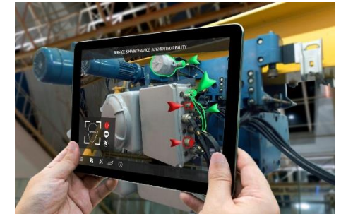
Augmented Reality 3