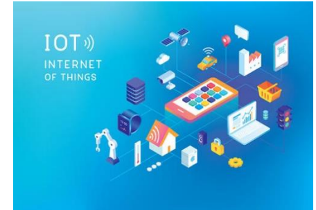
Internet of Things